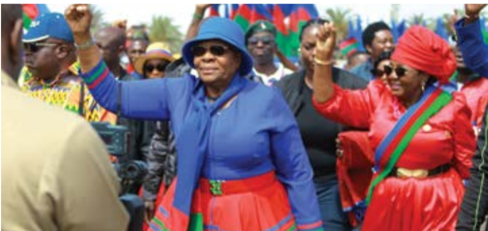
VP Netumbo Nandi-Ndaitwah and SWAPO SG Sophia Shaningwa as they arrived at the Kuisebmond Stadium last weekend.

2019 is certainly not 2024. Those SWAPO members and leaders who supported Iitula in 2019 will never join Iitula’s latest political jamboree in 2024. Iitula has made his choice, so too must he live with its consequences. SWAPO is made of strong steel. Others have tried in the past to bend it, but they dismally failed. Iitula, too, will suffer the same fate. About that, there is no doubt.