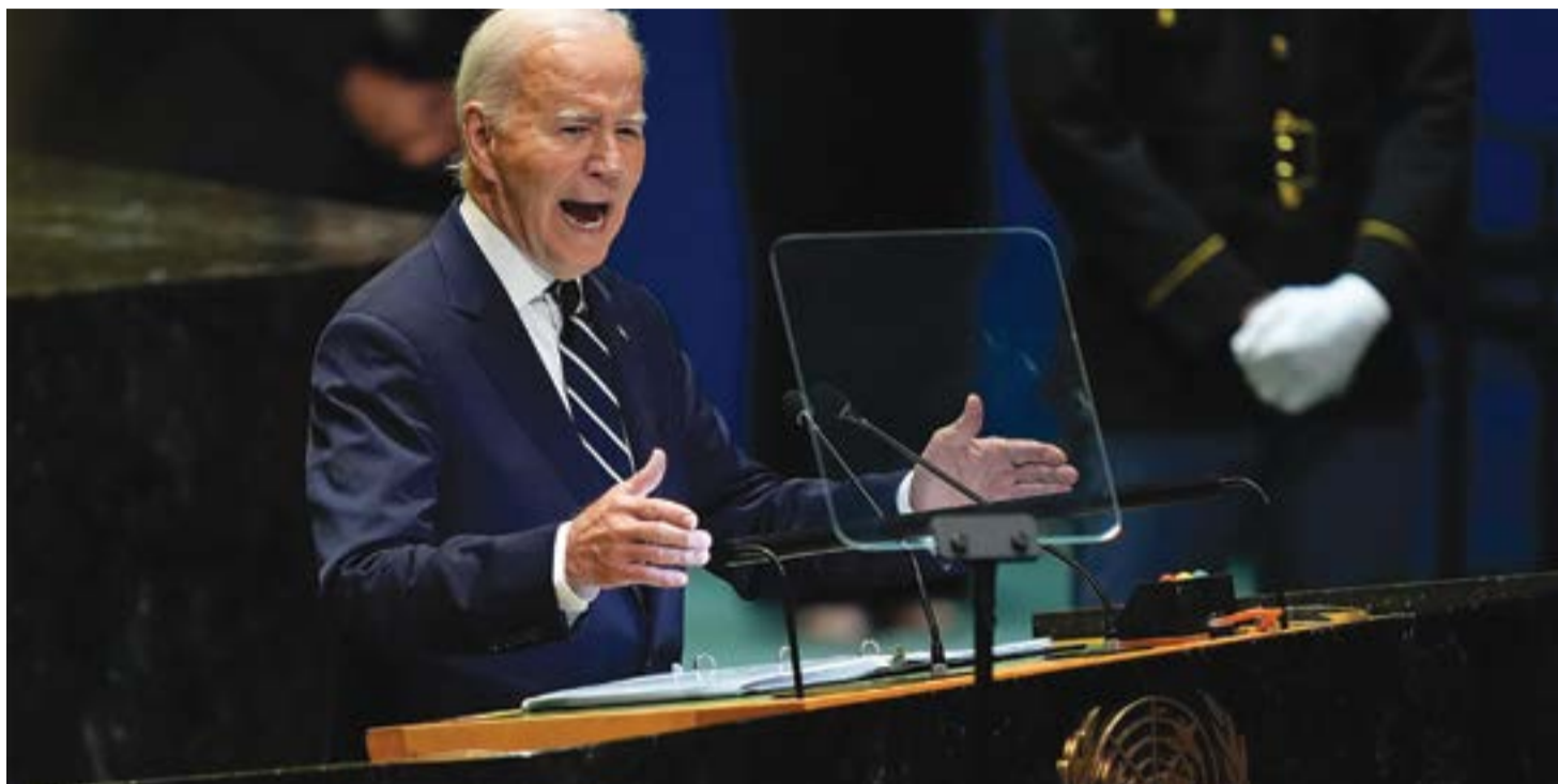
United States President Joe Biden addresses the 79th session of the United Nations General Assembly, Tuesday, September 24, 2024, at UN headquarters.