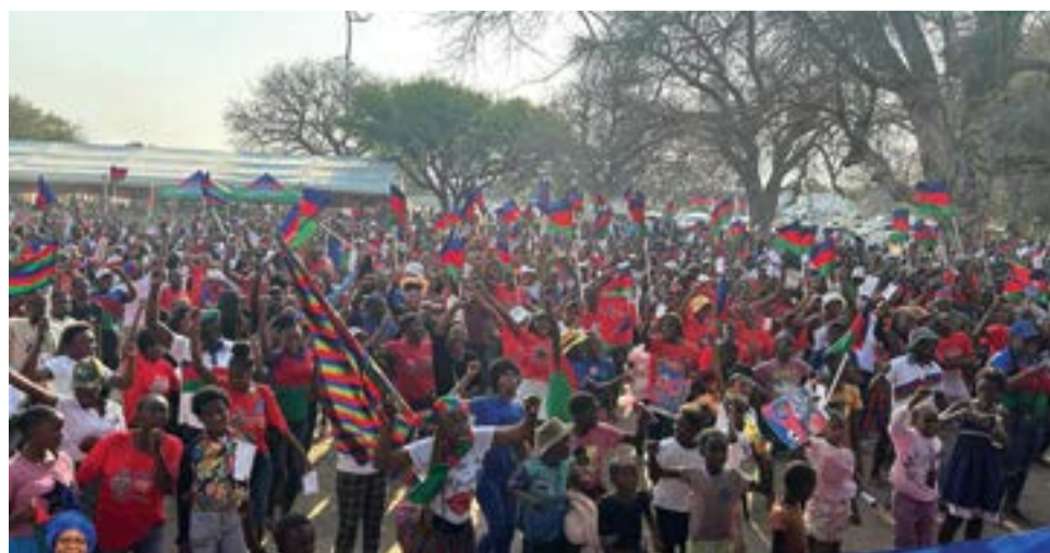
Part of SPYL members who turned up at Ongwediva Youth Mass Rally a few weeks ago.

He also addressed the broader issue of youth inclusion within the party, reflecting on past challenges and achievements. "The call for 40% youth representation was not achieved immediately, but we have listened to the feedback and are