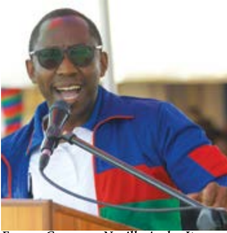
Erongo Governor Neville Andre Itope