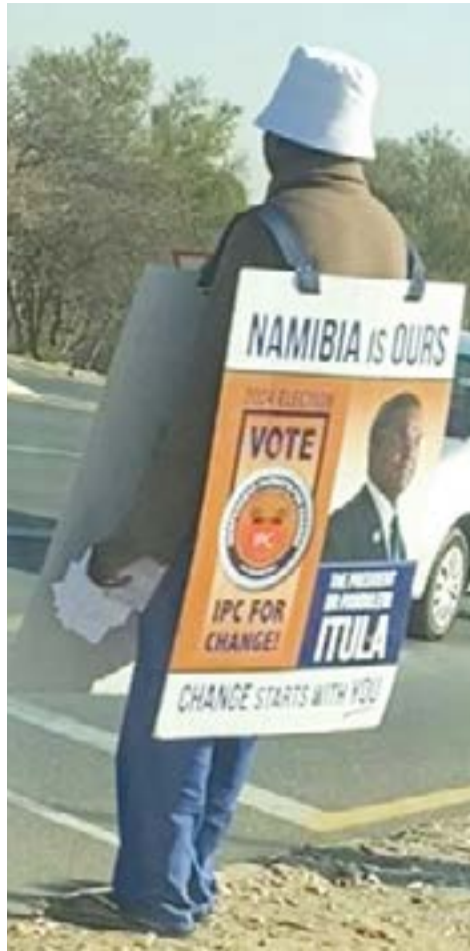
Poor unemployed people were paid peanuts to bear such placards at robots along Windhoek streets. This is an inhumane treatment indeed. Read Zoom In on this page